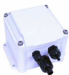
Optional Protective Cover Closed